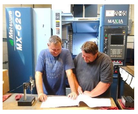
Our Professional Management Team & industry-leading Precision Machinists handle your most complex requirements