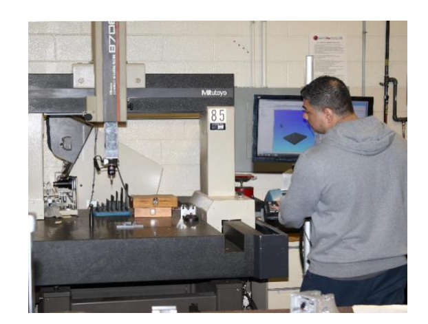
Our state-of-the-art Quality Control Lab with advanced inspection equipment to ensure high-quality, precision parts