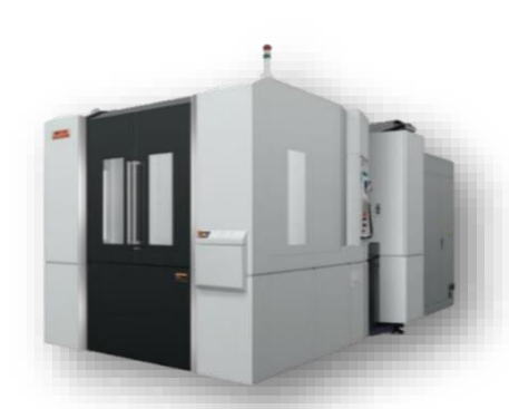
M<mark>ori Seiki</mark> NH8000 DCGII