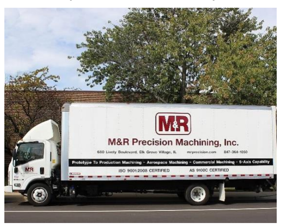
Our fleet of vehicles delivers products to you on-time, every time