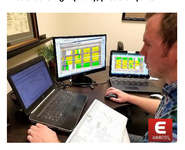
Our Production Scheduling & Supply Chain Department is always in control with our powerful JobBOSS ERP system