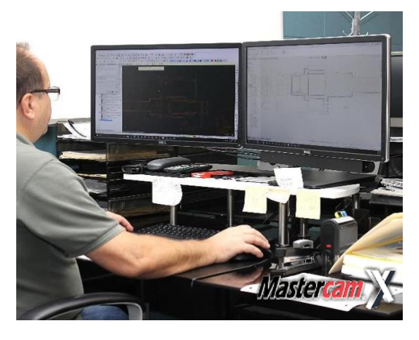
Our Engineering & Design Department is trained on the latest Mastercam 2018 CAD/CAM Multi-Axis Technologies