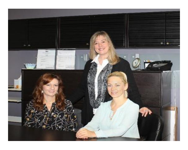
Our friendly and highly trained Customer Care Team is always on call to meet your every need