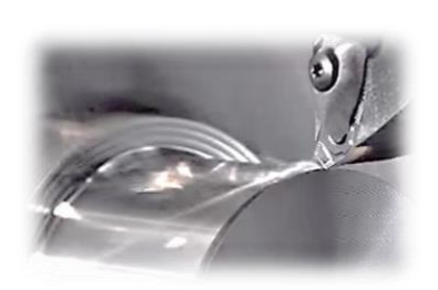
* CNC TURNING UP TO Ø29"