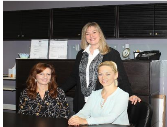
Our friendly and highly trained Customer Care Team is always on call to meet your every need