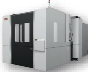
MORI SEIKI NH8000 DCGII