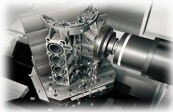
* CNC 5-AXIS MILLING UP TO 20" x 13.5"