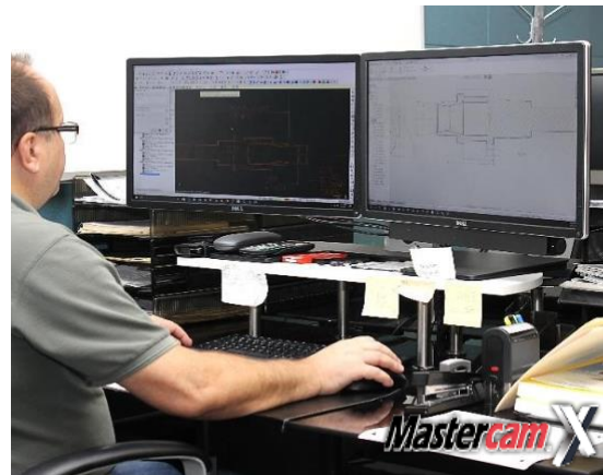
Our Engineering & Design Department is trained on the latest Mastercam 2018 CAD/CAM Multi-Axis Technologies