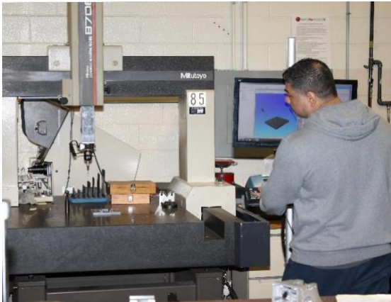
Our state-of-the-art Quality Control Lab with advanced inspection equipment to ensure high-quality, precision parts