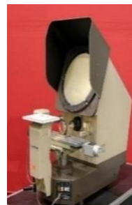
MITUTOYO PH350H OPTICAL COMPARITOR