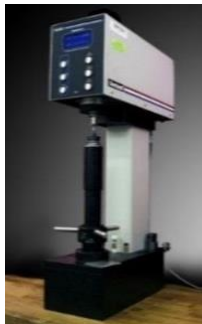
ROCKWELL HARDNESS TESTER- ASTM E-18