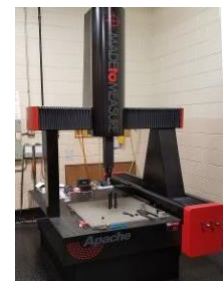
APACHE BLACKHAWK 8.10.6