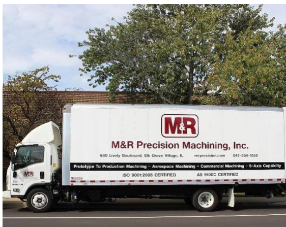
Our fleet of vehicles delivers products to you on-time, every time