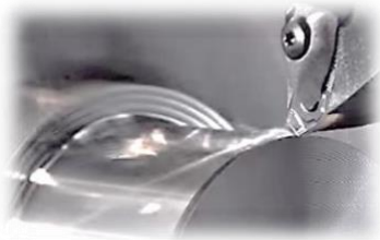
* CNC TURNING UP TO Ø29"