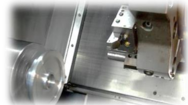
* CNC TURNING WITH FULL Y-AXIS MILLING CAPABILITIES