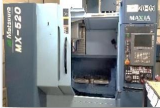
MATSUURA 5-AXIS MX-520