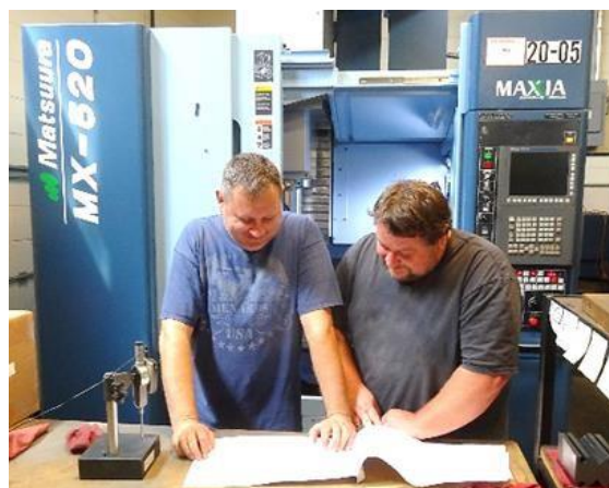
Our Professional Management Team & industry-leading Precision Machinists handle your most complex requirements