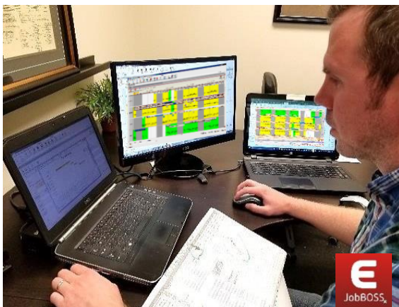
Our Production Scheduling & Supply Chain Department is always in control with our powerful JobBOSS ERP system